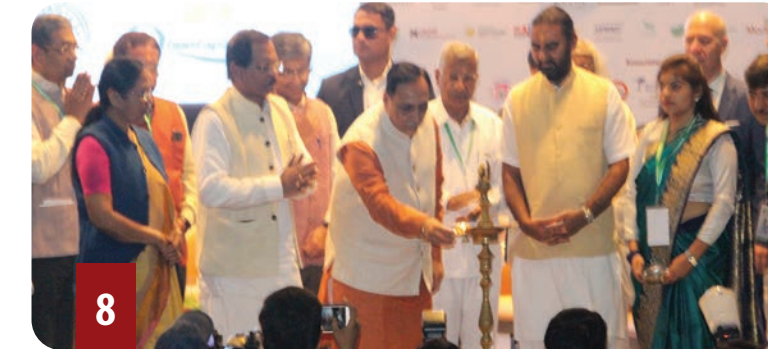
7 th World Ayurveda Congress & Arogya Expo, 1-4 December, 2016 - Kolkata Theme: Strengthening the Ayurveda Eco Systems