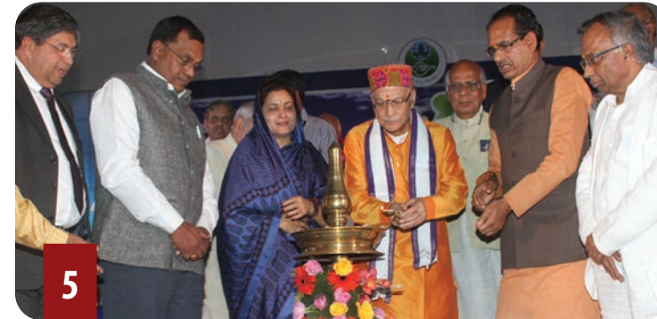
4 th World Ayurveda Congress & Arogya Expo, 9-13 December 2010 - Bengaluru Theme: 'Ayurveda for all'